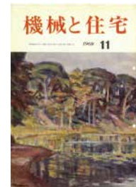
The front cover design from the early days of publication