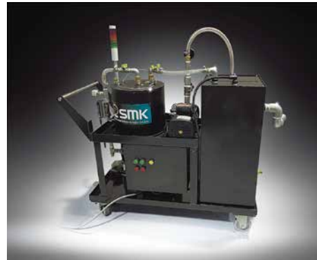
"Bub Power" UFB