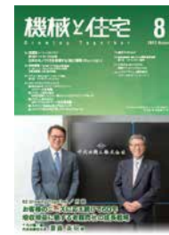
The current front cover design