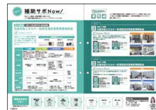
Page presenting information about subsidies and grants

The magazine includes special reports on topics related to current market needs.